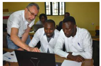
3D modeling of orthosis using the Picasso system