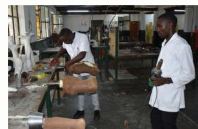
Thermoforming of milled models with 3D cad/cam technology