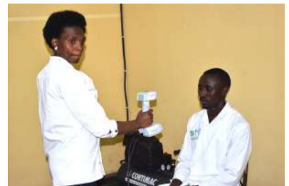
3D scanning of the patient